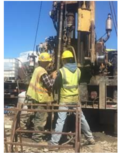
Phase I Drilling at ALCOSAN's Treatment Plant

selection and feasibility studies considering preliminary staging needs; conducting analysis and investigations of prior local tunnel construction experience; consultation and peer review of geotechnical investigations by others; risk identification and mitigation; and reviewing key deliverables during preliminary design.